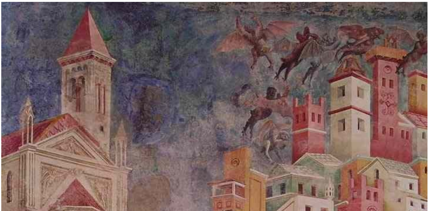
Legend of St. Francis fresco cycle --Upper Church, San Francesco, Assisi (particular)

INEQUALITY, TECHNOLOGY AND INSTITUTIONS IN EUROPE